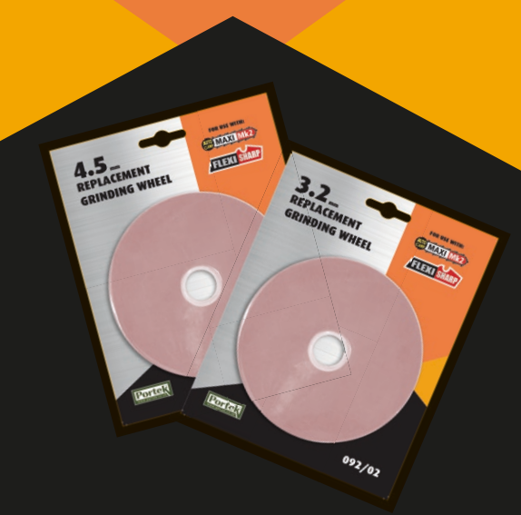
4.5mm and 3.2mm replacement sharpening wheels available