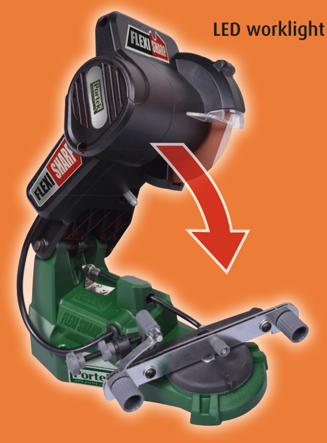
Clamps chain automatically as the sharpening wheel is lowered